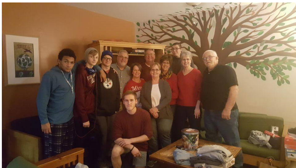
The young men at Zerby Gap Familyworks enjoyed and appreciated the "Angel" tree gifts. Thank you to all who participated. This outreach could not happen without you!